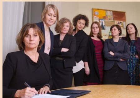
Minister for International Development Cooperation and Climate Isabella Lövin signs the Government proposal for a new Climate Act