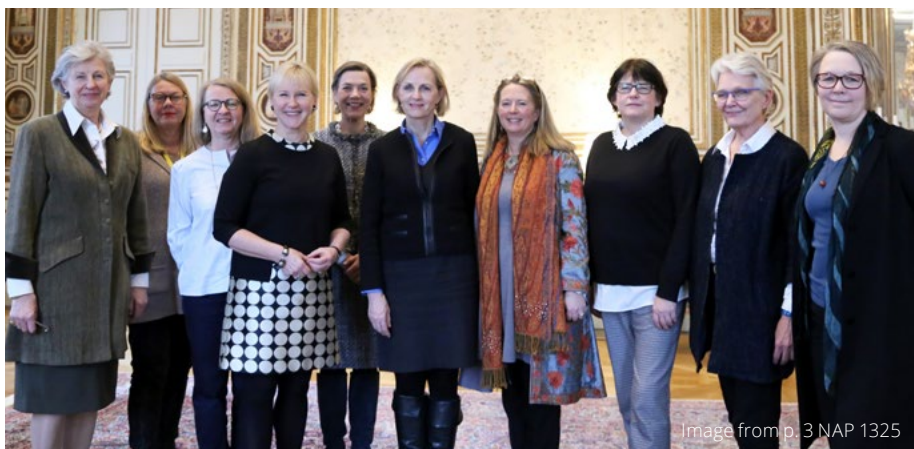
Image from p. 3 NAP 1325

The Swedish Women's Mediation Network was initiated in 2015 in response to the significant under-representation of women in mediation and peace processes. The aim of the network is to promote peaceful conflict resolution and actively support women's meaningful participation in peacebuilding initiatives – before, during and after conflicts. The mediation network consists of members with different thematic and geographic fields of expert knowledge, from both civil society and the Swedish Ministry for Foreign Affairs. All members are women in senior positions with long experience of peacebuilding, diplomacy and political processes. So far, they have been involved in countries including Afghanistan, Burundi, Colombia, Georgia, Somalia, Ukraine and Zimbabwe. These efforts have taken place at different levels, and have included strategic support for women in different local societies as well as contributions to peace negotiations at the highest formal level. The Swedish mediation network is part of a Nordic mediation network, and works closely alongside a number of similar initiatives, not least in Africa and the Mediterranean region, and with the UN, the EU, the AU and OSCE. The mediation network is a flexible resource that can engage at short notice in different conflict contexts and respond quickly to needs that arise. There is great demand, and the network has had to be expanded from nine to 15 members.