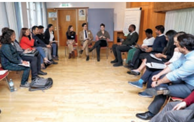
Workshop 1 discussion